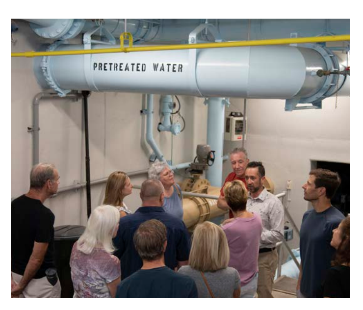
Page 4 of 6