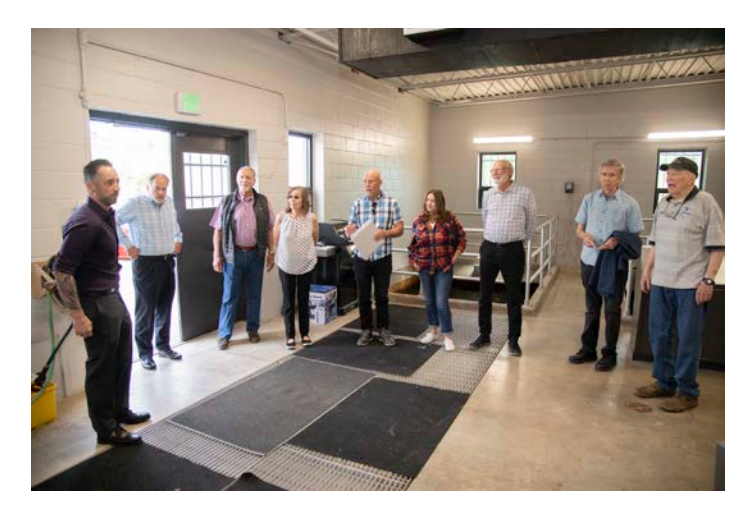
Page 6 of 6